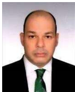
Rauf Alp Denктаş