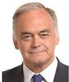
Esteban González Pons