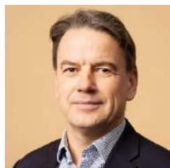
Christian Friis Bach