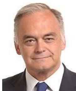
Esteban González Pons

Vice-President of the European Parliament